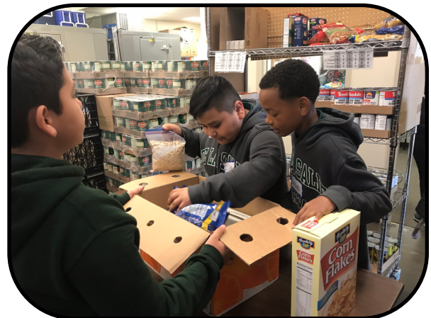
4 years ago at Monument Crisis Center

We want to take a moment and congratulate our Class of '22. We are so fortunate that 15 of our graduates have been accepted to and will continue their Lasallian Catholic education at De La Salle High School in the Fall!