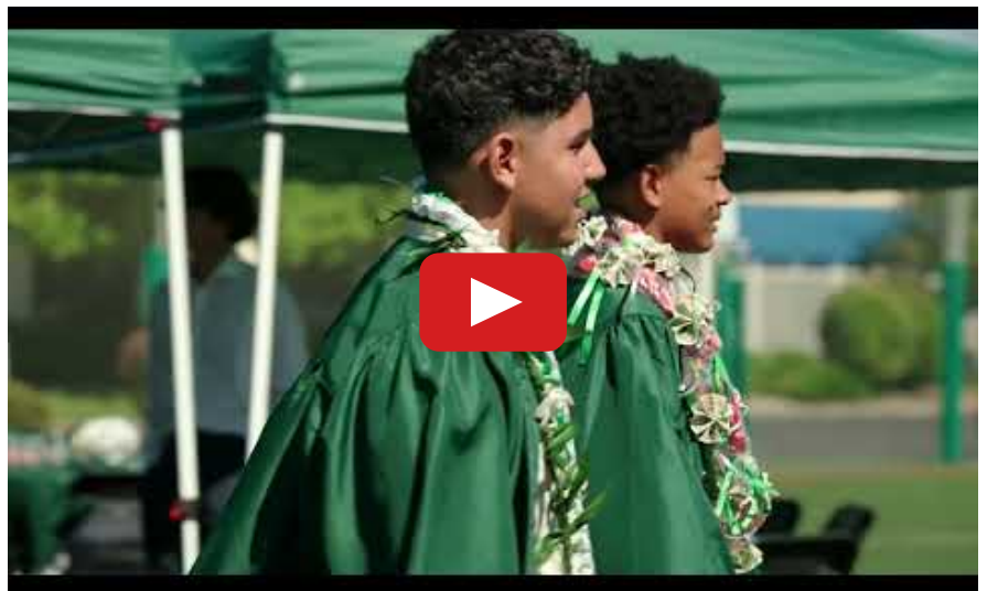
Class of 2022 Graduation

We look forward to sharing all the wonderful things that have happened at De La Salle Academy. Great results come from hard work. Well done, DLSA!