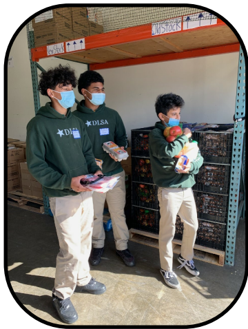
Class of 2022 Service at Monument Crisis Center

The DLSA Class of 2022 served as a light for others in various ways throughout their DLSA journey. They embraced the motto of "Enter to Learn, Leave to Serve" by engaging in service at the Monument Crisis Center in their final week as DLSA Students. This is service that they experienced as incoming 5th graders during their Summer Orientation.