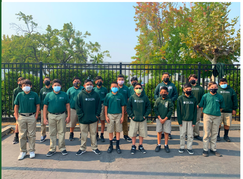
Pictured: 7th grade class

De La Salle Academy works with philanthropists and community partners to provide students, graduates, and families with access to quality educational opportunities that might not otherwise be available to them due to geographic or socioeconomic factors.