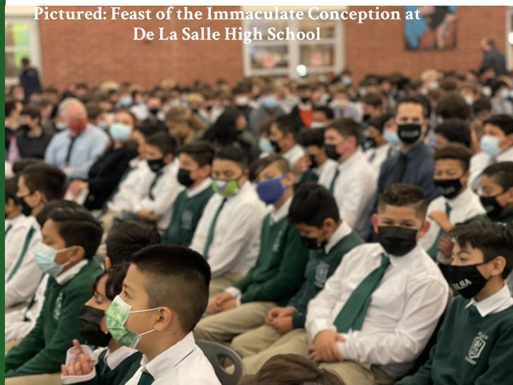
Feast of the Immaculate Conception at De La Salle High School

At DLSA, we honor him and all of our Brothers who serve and dedicate their time, energy and love to those around them. We also offer our prayers of support and solidarity with our fellow San Miguel schools across the United States.